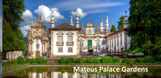
Mateus Palace Gardens